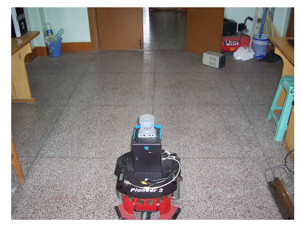
Fig. 2. Experiment environment

a large number of particles to gain a high positioning accuracy, and the positioning accuracy is easily influenced by the number of particles. But the algorithm used in this article can reach a higher accuracy by taking only a few particles. When the number of particles reaches a certain number, the positioning accuracy will not be influenced by the number of particles.